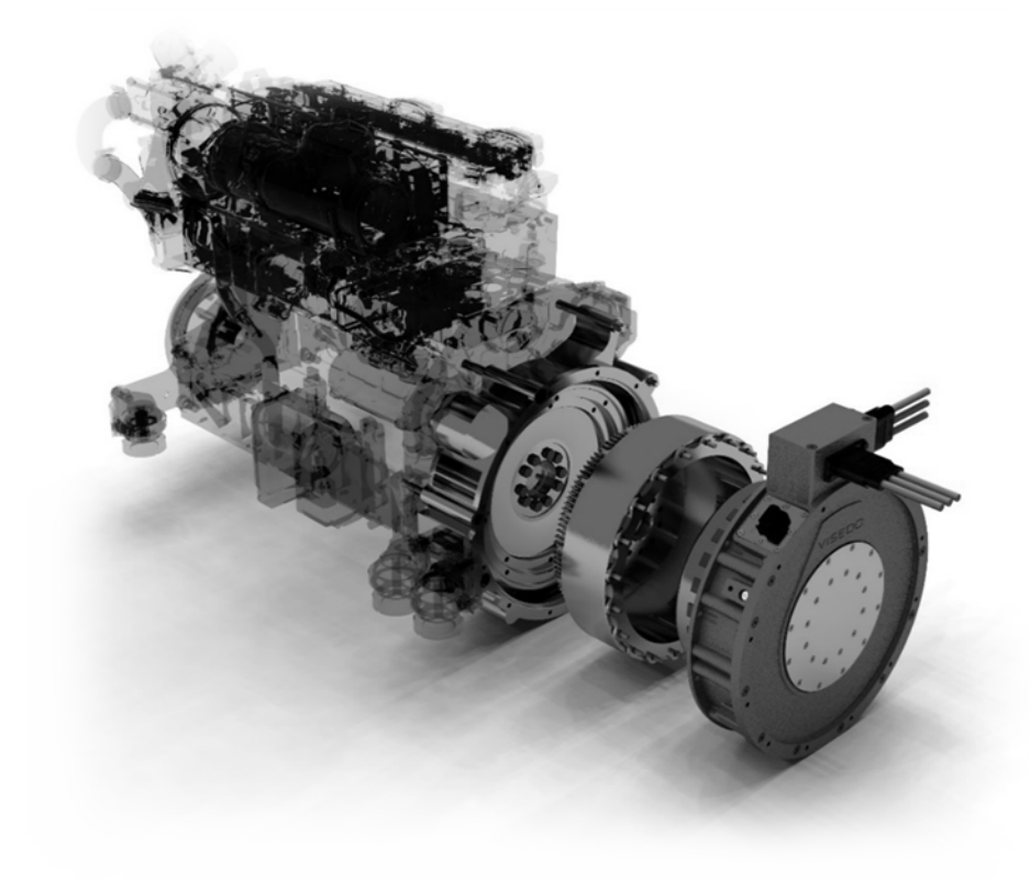
Picture 2 Integrated machine connected to diesel engine flywheel housing

Integrated machine is commonly connected directly to the diesel engine flywheel housing. In such application, part of the motor is inside the diesel engine. Exploded view of this kind of application is shown below.